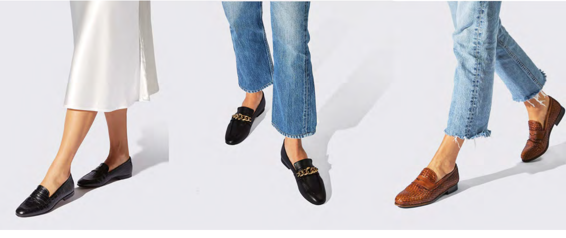
FRANCESCA BIANCA ADELE